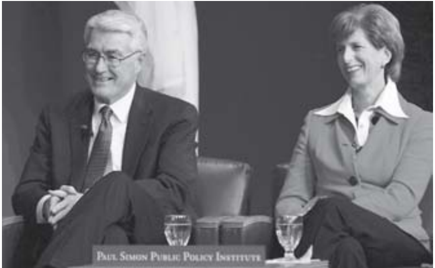
Former Governors Jim Edgar of Illinois and Christy Todd Whitman of New Jersey share a laugh during the discussion on the future of moderates in politics.

Edgar agreed. “It’s becoming more and more difficult to be elected as a moderate,” Edgar said. “In primaries, it’s more or less become voters from the two extremes.”