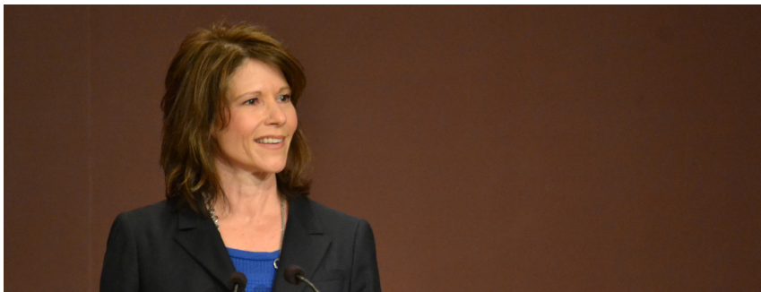
U.S. Rep. Cheri Bustos speaking at luncheon in March 2013.

“This outside money is very, very harmful to the democratic process,” she said. “Think of what could have been done with money like that.”