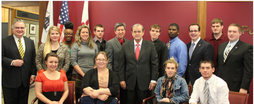
Former U.S. Congressman Jerry Costello meeting for a discussion with students after his lecture in March.