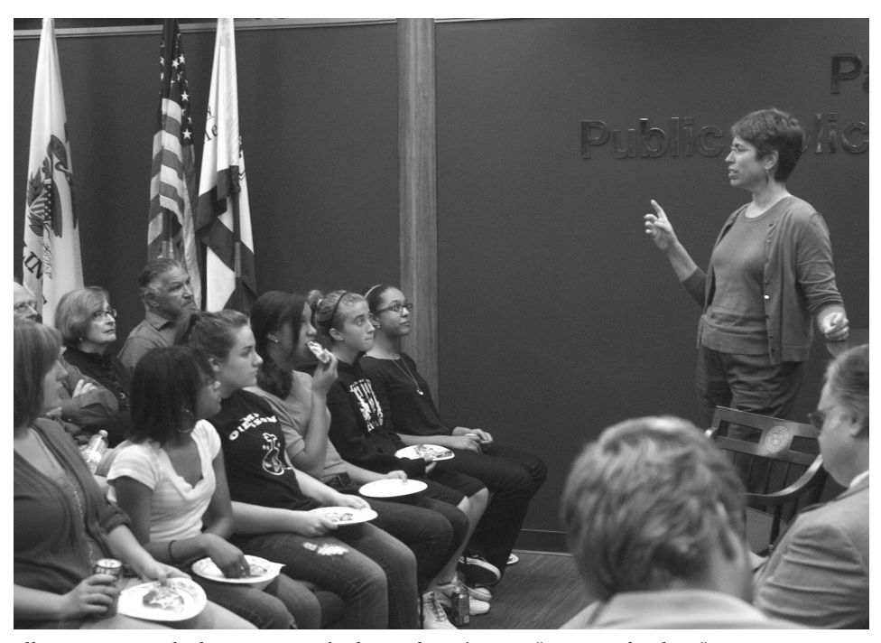
Illinois Lt. Gov. Sheila Simon was the featured speaker at a "Pizza and Politics" session on Women in Politics.

Visit our website to watch for new programs at www.paulsimoninstitute.org.