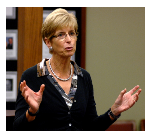
Former New Jersey Gov. Christine Todd Whitman kicked off the Institute's Women in Politics Series.