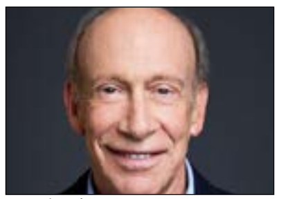
Ira Shapiro Former U.S. Trade Ambassador