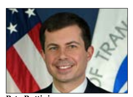
Pete Buttigieg Former U.S. Presidential Candidate; Former Mayor of South Bend, Indiana