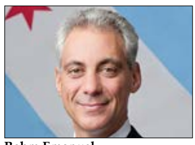
Rahm Emanuel Former Mayor of Chicago